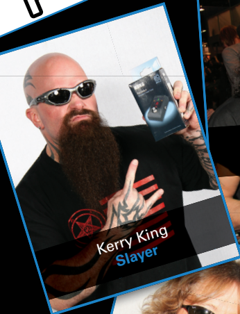
Kerry King Slayer