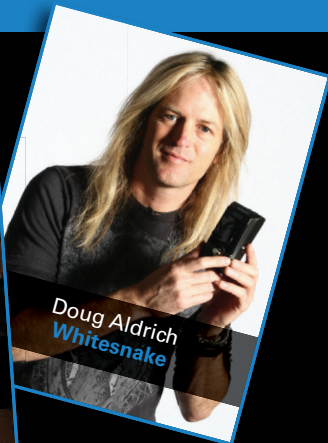
Doug Aldrich Whitesnake